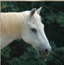
"Fits" Sponsored by Collins Commercial Properties

It is with great sadness we said, "so long" to three of our equine therapy partners, all of which have been with Riverwood since our humble beginnings 20 years ago. We are so thankful to have known these horses and for the many lessons they taught us in their time here.